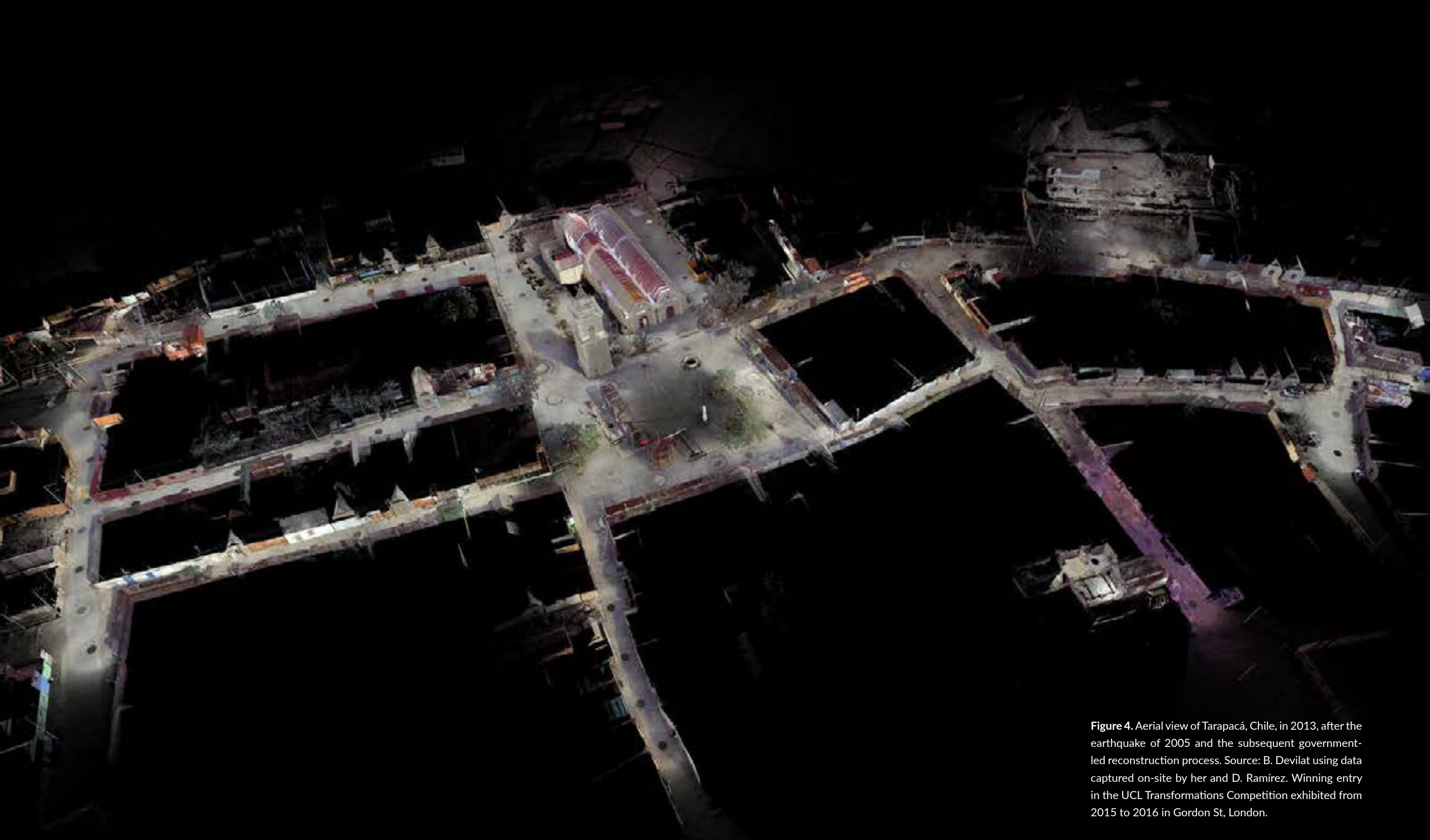
Figure 4. Aerial view of Tarapacá, Chile, in 2013, after the earthquake of 2005 and the subsequent government-led reconstruction process. Winning entry in the UCL Transformations Competition exhibited from 2015 to 2016 in Gordon St, London.