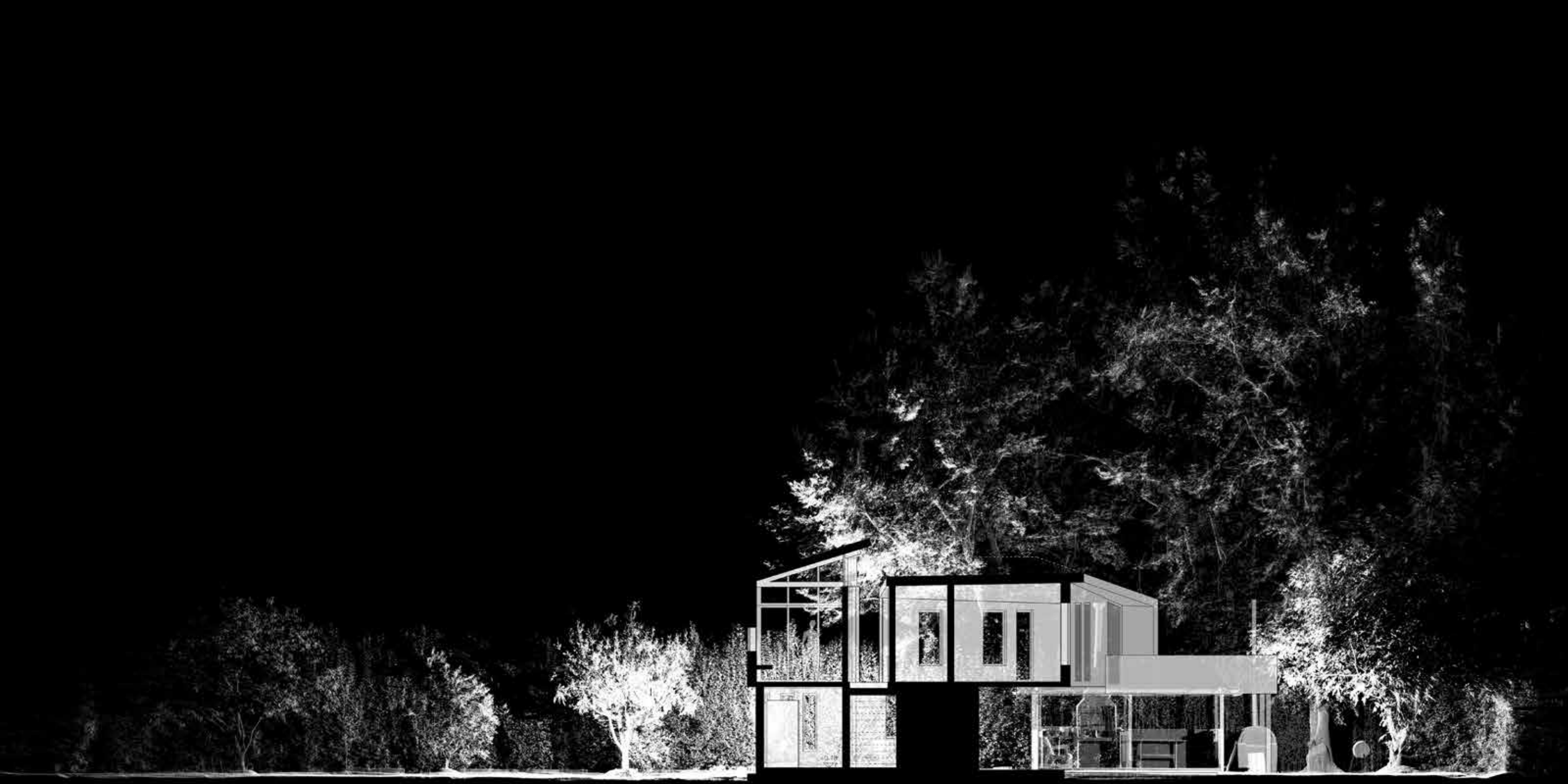
Figure 11. Section of the design within the 3D laser scanning point-cloud, 2017.