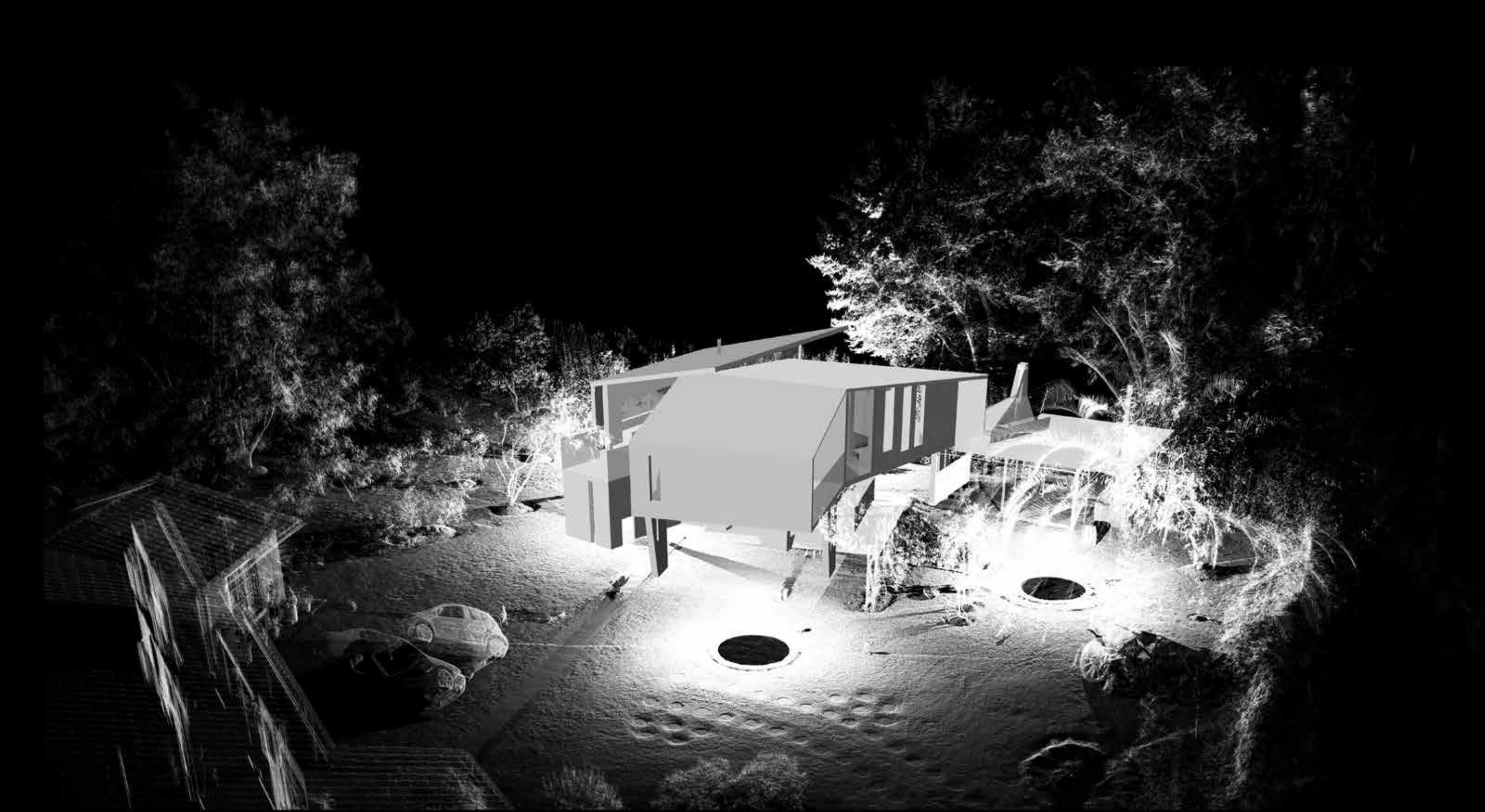
Figure 9. Aerial view of the design placed within the 3D laser scanning point-cloud, 2017.