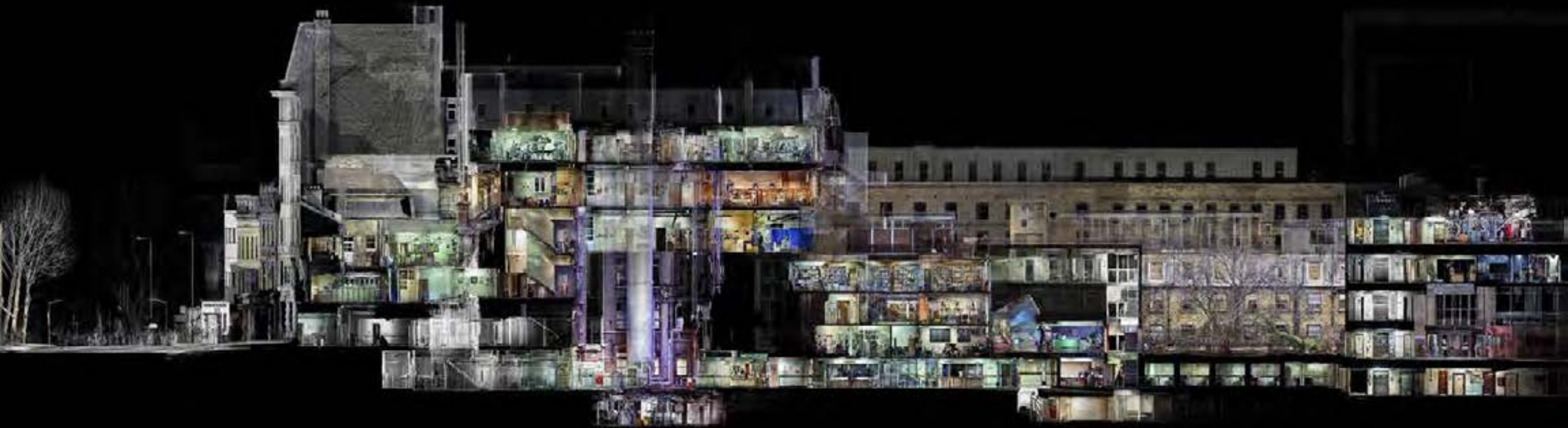
Figure 14. Section of the RNTNEH in Greys Inn Road, London, where different cutting planes were overlapped in order to peek inside the rooms. This artwork is part of the permanent exhibition 'The Texture of Air'. Source: B. Devilat, in collaboration with L. Mitchison, with on-site data captured by B. Devilat (tutor), E. Ergin, F. Lanuza, F. Onsiper & M. C. Venegas, as part of the Bartlett School of Architecture UCL training activities. More information here: https://www.thetextureofair.uk/