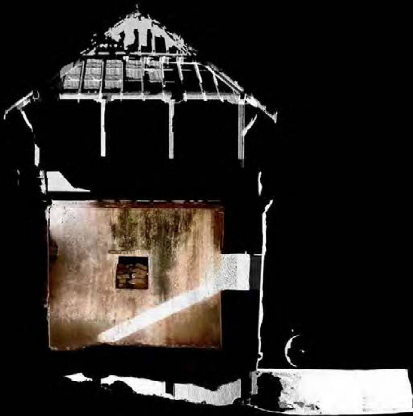
Figure 13. Section of a birdfeeder (Chabutra) in Bela, Gujarat, India, as documented in 2021.