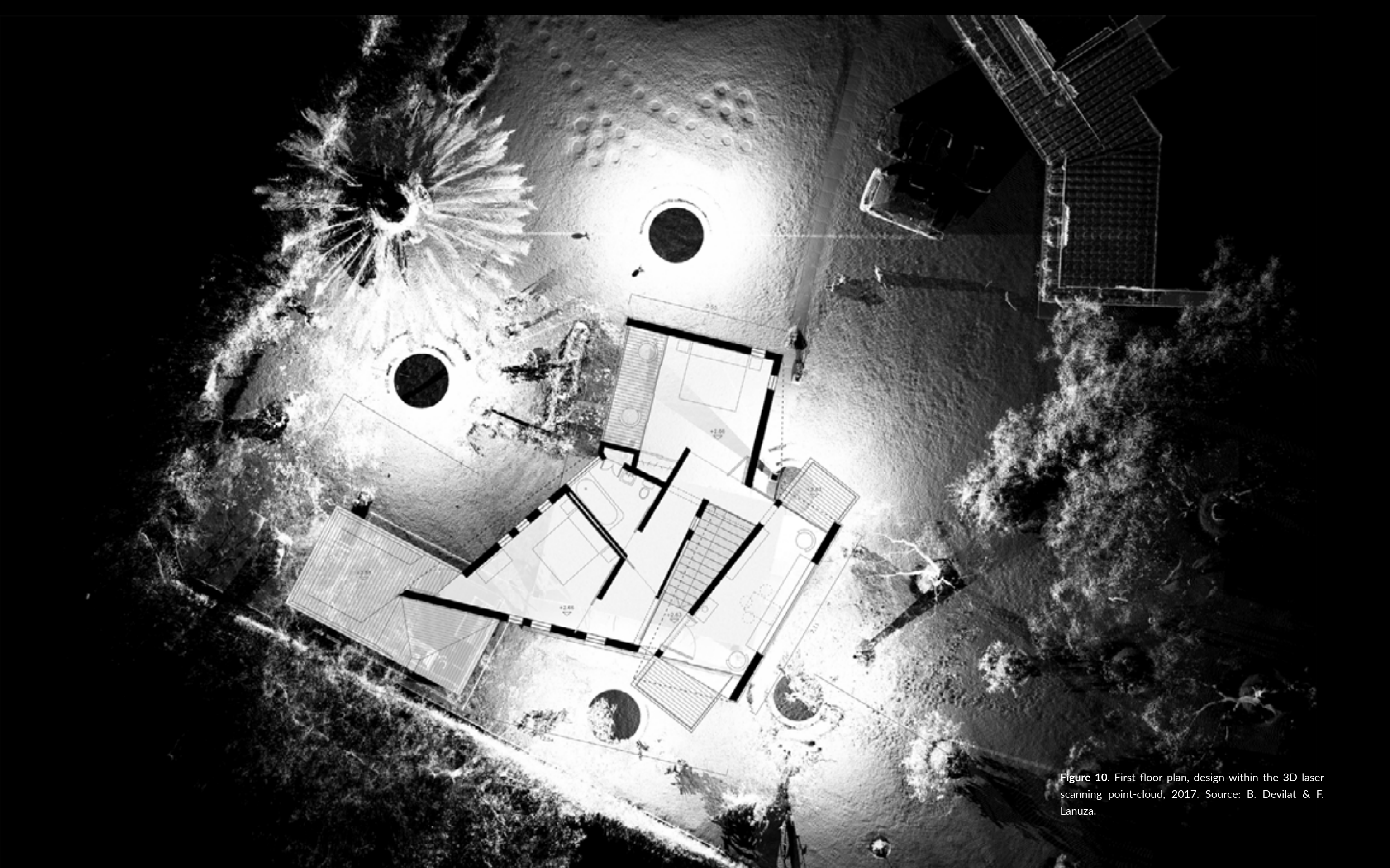
Figure 10. First floor plan, design within the 3D laser scanning point-cloud, 2017.