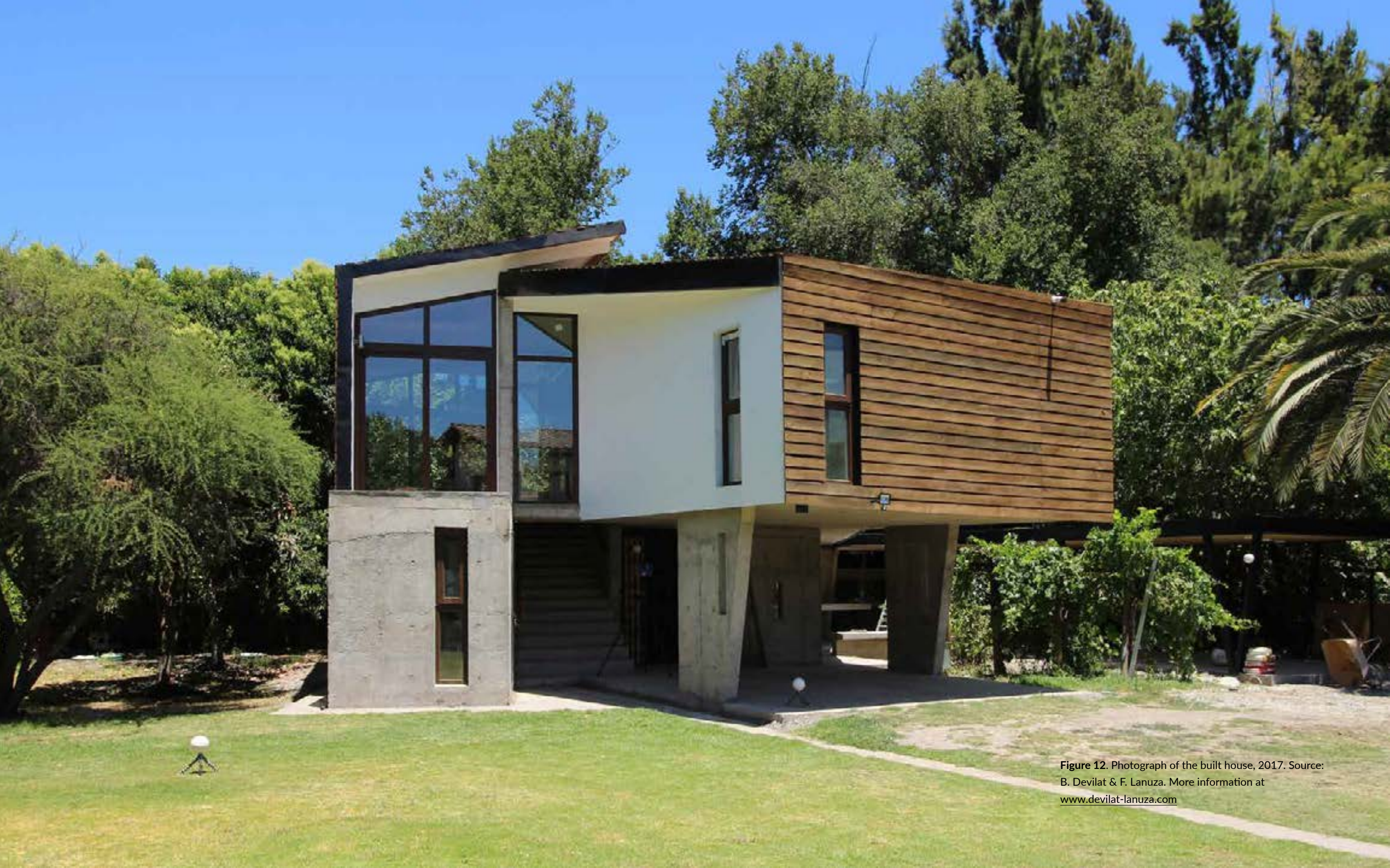
Figure 12. Photograph of the built house, 2017. Source: B. Devilat & F. Lanuza. More information at www.devilat-lanuza.com