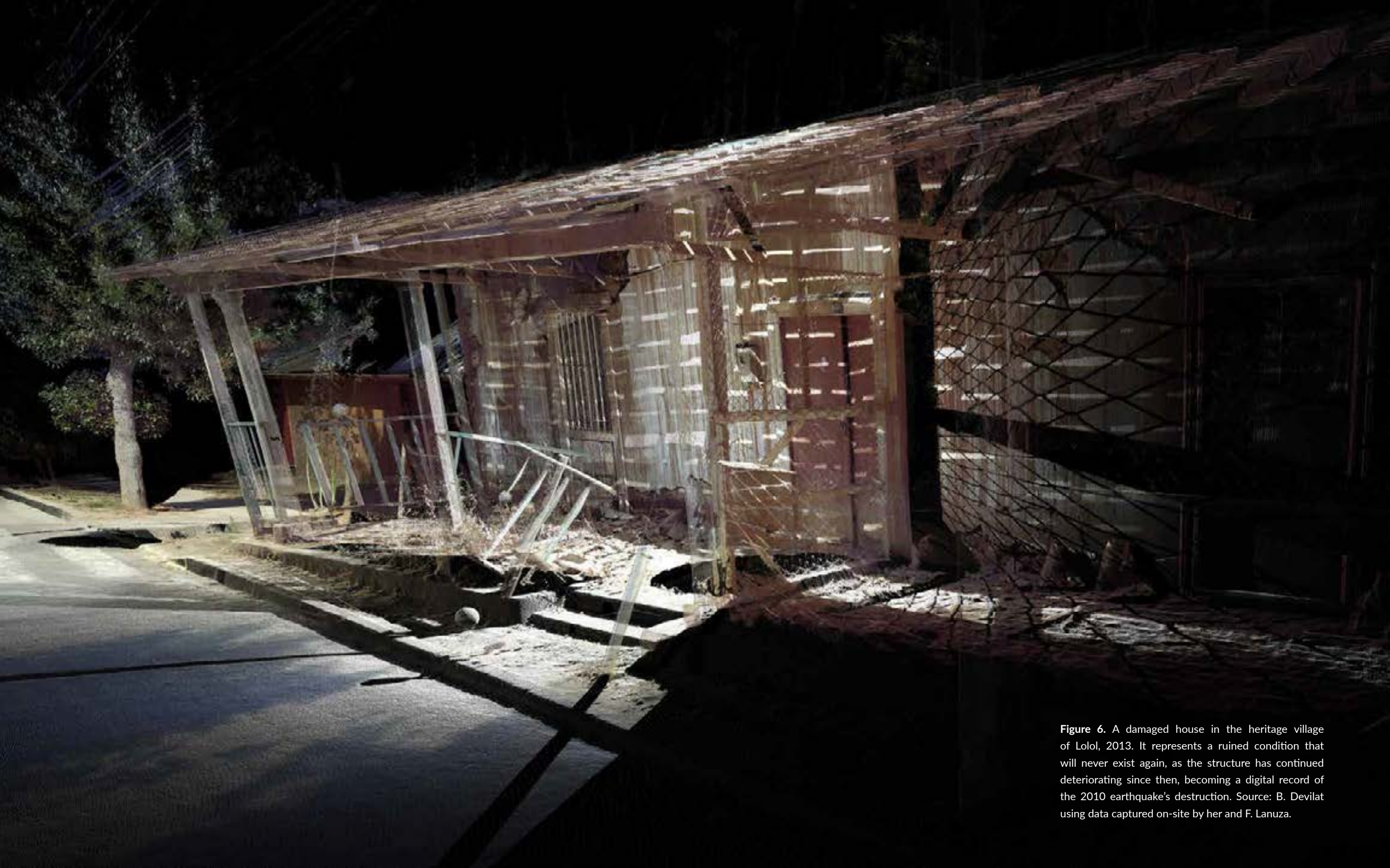
Figure 6. A damaged house in the heritage village of Lolol, 2013. It represents a ruined condition that will never exist again, as the structure has continued deteriorating since then, becoming a digital record of the 2010 earthquake's destruction.