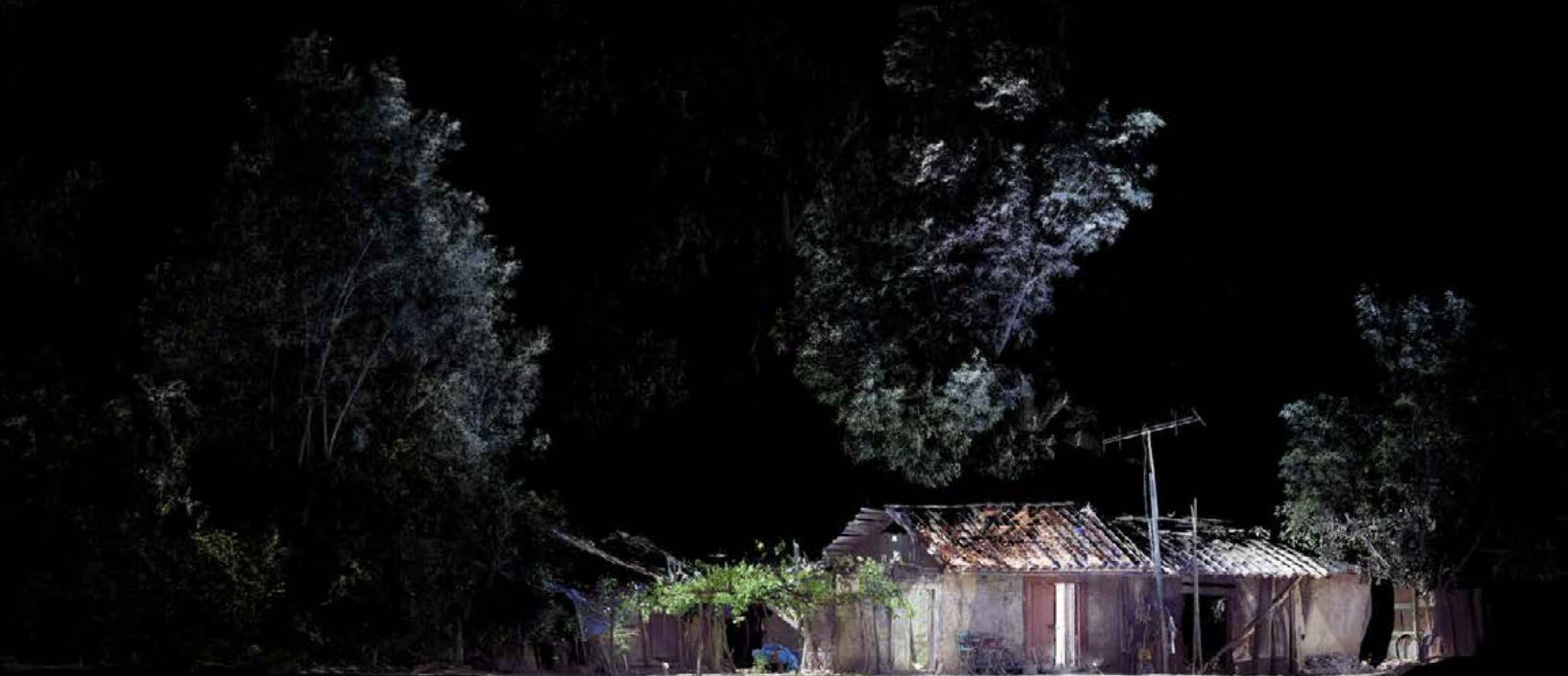
Figure 5. A house in the heritage village of Zúñiga in 2013, still damaged by the 2010 earthquake. The inherent transparency of the 3D point cloud renders domesticity from an outside perspective, with the house partially damaged by the earthquake yet still inhabited. This image obtained the first Prize in the UCL Research Images as Art / Art Images as Research Competition at UCL Doctoral School, 2016.