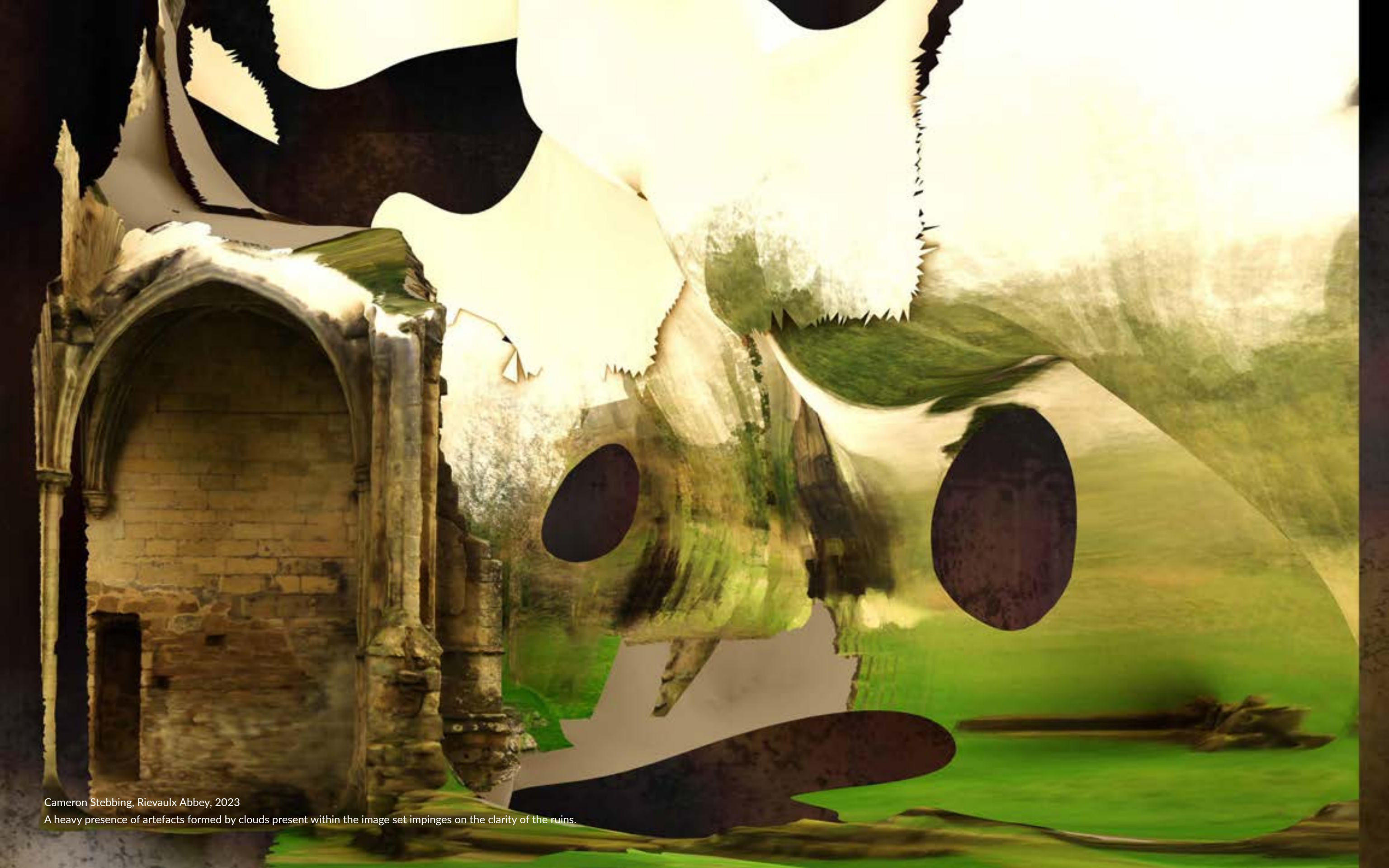
Cameron Stebbing, Rievaulx Abbey, 2023

A heavy presence of artefacts formed by clouds present within the image set impinges on the clarity of the ruins.