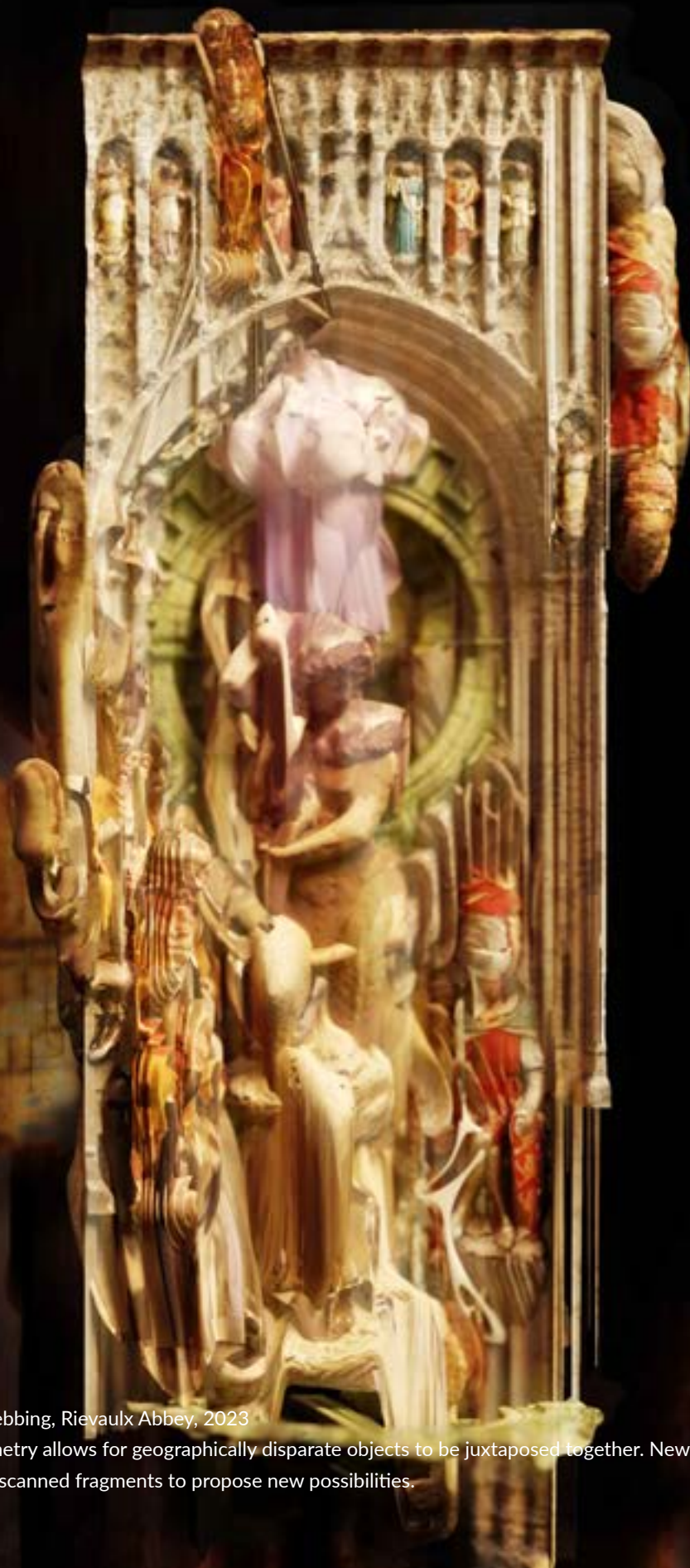
Cameron Stebbing, Rievaulx Abbey, 2023

Photogrammetry allows for geographically disparate objects to be juxtaposed together. New 'artefacts' are formed by directly acting upon scanned fragments to propose new possibilities.