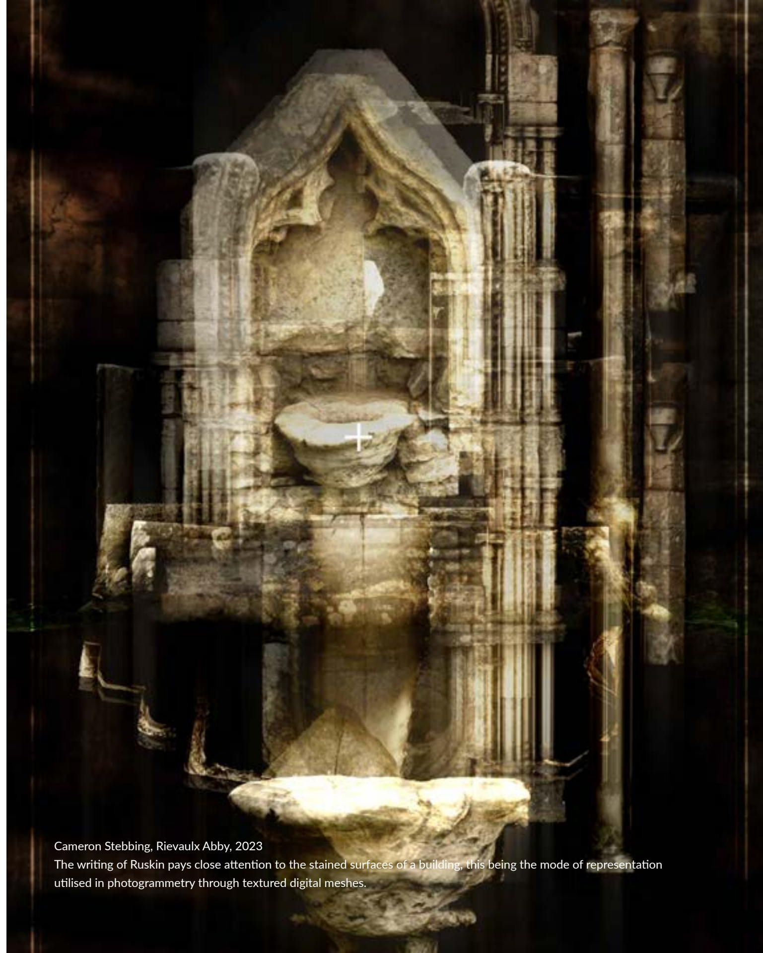
Cameron Stebbing, Rievaulx Abby, 2023

The writing of Ruskin pays close attention to the stained surfaces of a building, this being the mode of representation utilised in photogrammetry through textured digital meshes.