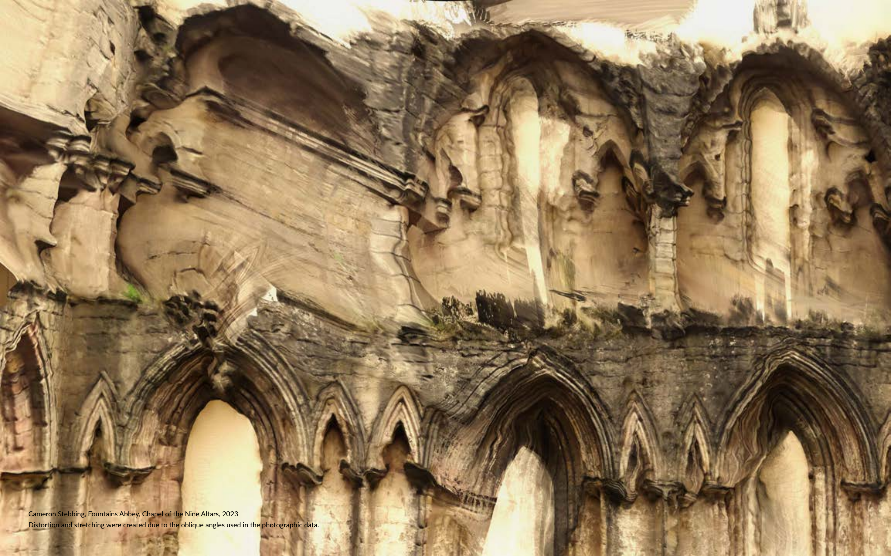
Cameron Stebbing, Fountains Abbey, Chapel of the Nine Altars, 2023 Distortion and stretching were created due to the oblique angles used in the photographic data.