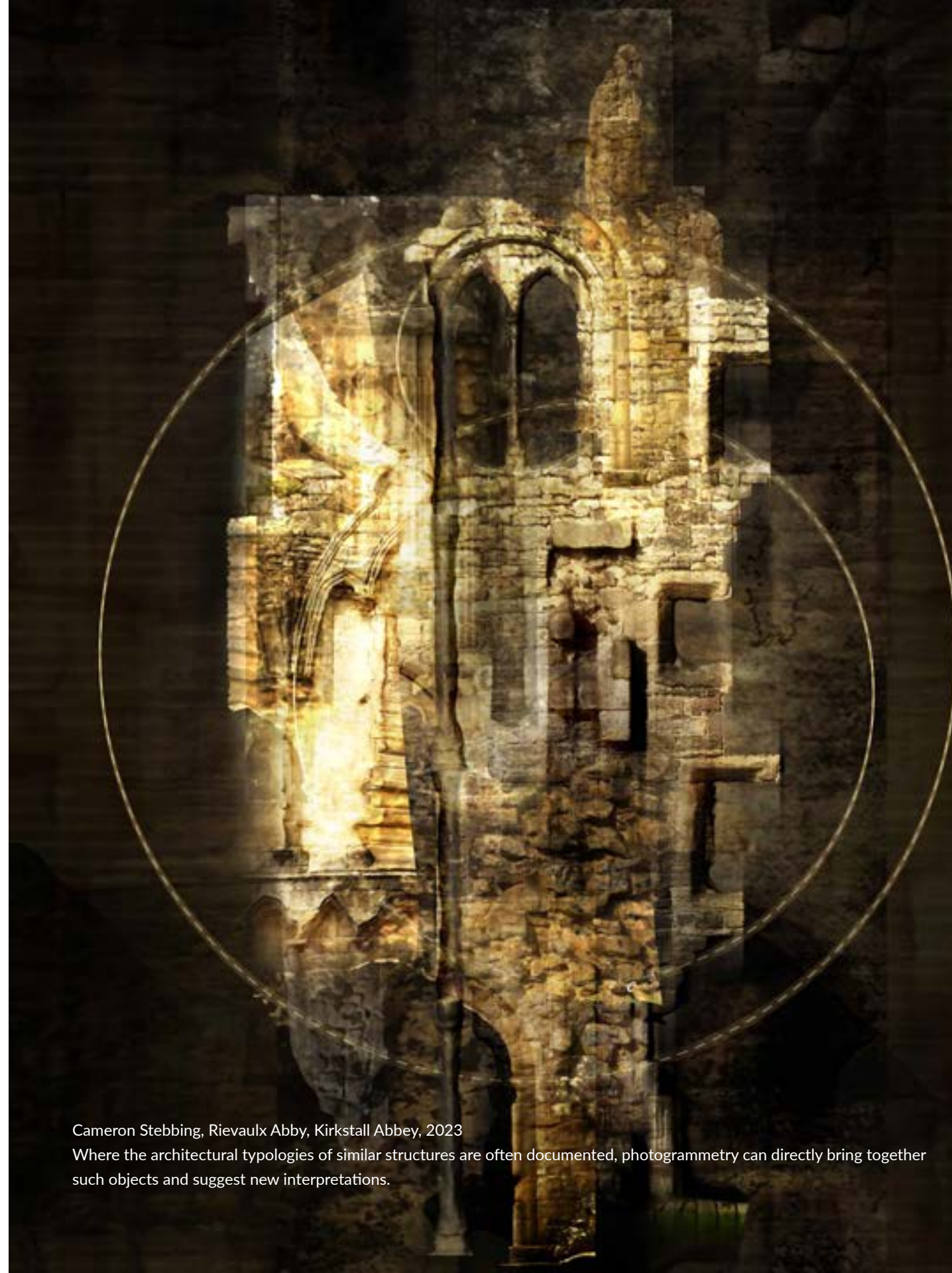
Cameron Stebbing, Rievaulx Abby, Kirkstall Abbey, 2023

Where the architectural typologies of similar structures are often documented, photogrammetry can directly bring together such objects and suggest new interpretations.